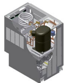
Unit is also available in Water-Cooled