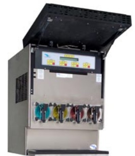
Tall Door, Front Lift