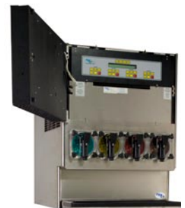
Side Open Door is Available in Short or Tall Version