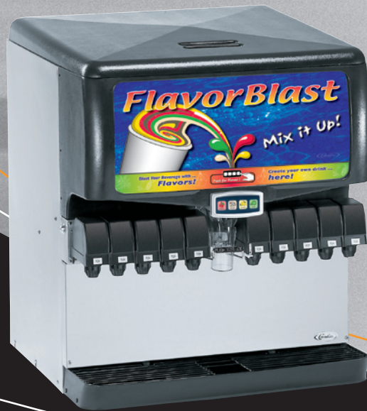
ENDURO 250 WITH FLAVORBLAST™